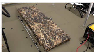
Padded helm cushion