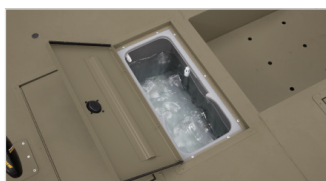
Bow 15-gal. aerated livewell