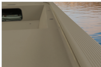
VERSATRACK® accessory-mounting channels