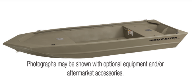
Photographs may be shown with optional equipment and/or aftermarket accessories.