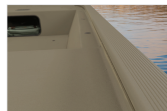
VERSATRACK® accessory-mounting channels