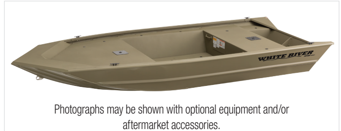
Photographs may be shown with optional equipment and/or aftermarket accessories.